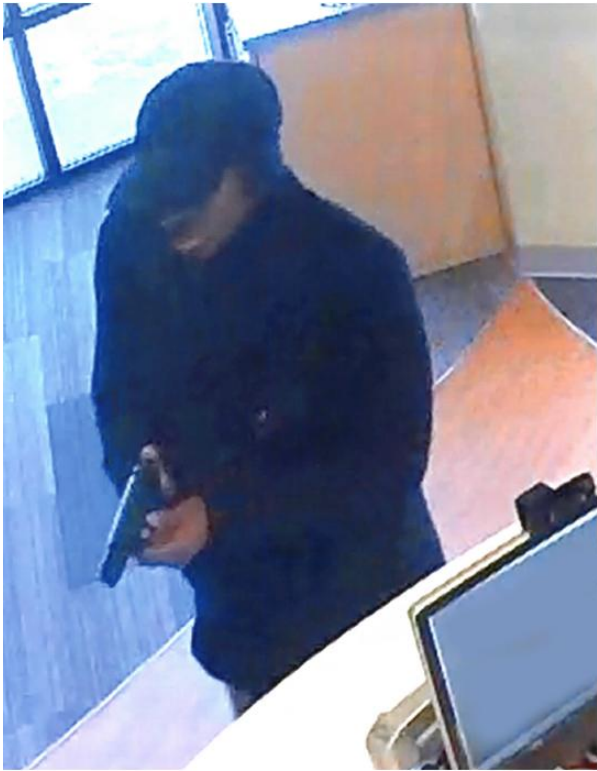
January 31, 2015: Wright-Patt Credit Union 3134 North High Street, Columbus, OH