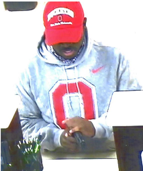
December 23, 2013: Huntington National Bank 1600 Bethel Road, Columbus, OH