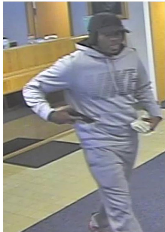
January 7, 2014: First Community Bank 2121 Bethel Road, Columbus, OH