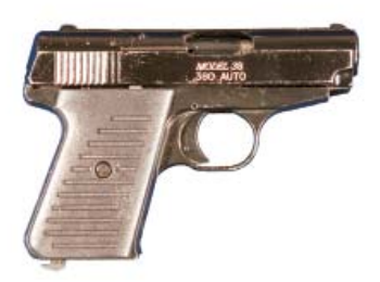
9. BRYCO ARMS .380 Semiautomatic Pistol