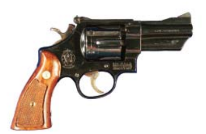
7. SMITH & WESSON .357 Revolver