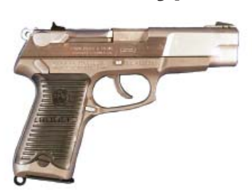
2. STURM, RUGER & CO. 9mm Semiautomatic Pistol