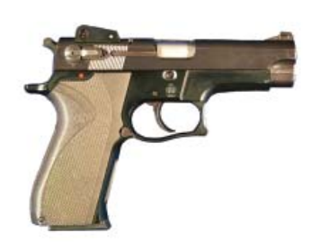
6. SMITH & WESSON 9mm Semiautomatic Pistol