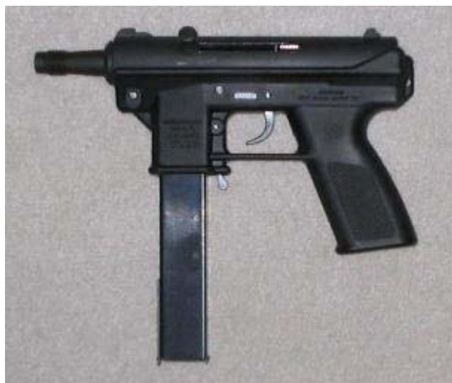
Illustration of a 9mm Intratec