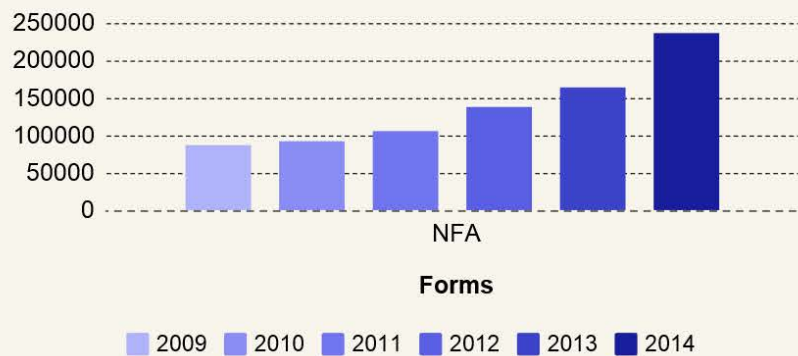
Annual Amount of NFA Forms Processed

In addition, the legalization of silencers for hunting in about 40 states has led to a significant increase in the processing of NFA forms.