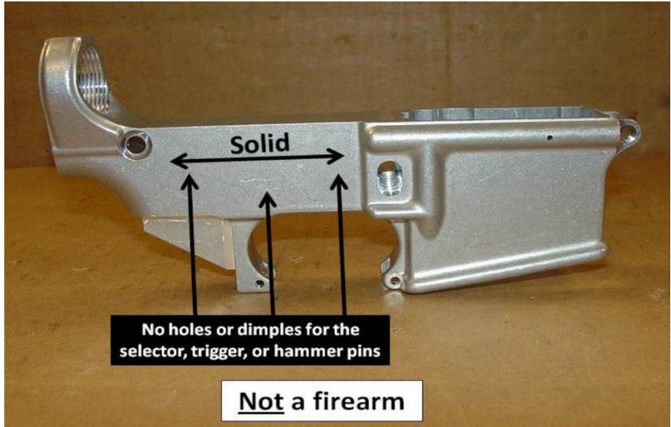
(if not sold, distributed, or marketed with any associated templates, jigs, molds, equipment, tools, instructions, or guides)

Thus, in order <u>not</u> to be considered " readily " completed to function, ATF has determined that a partially complete AR-type receiver must have no indexing or machining of any kind performed in the area of the trigger/hammer (fire control) cavity. <u>A partially complete AR-type receiver</u> with no indexing or machining of any kind performed in the area of the fire control cavity is not classified as a " receiver ," or " firearm ," if not sold, distributed, or marketed with any associated templates, jigs, molds, equipment, tools, instructions, or guides, such as within a receiver parts kit.